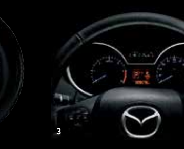
1. Black-framed rear combination lamps add to the rear's masculinity. 2. Machined 17-inch aluminium wheels with striking gunmetal paintwork. 3. Handsome passenger-car-style meter cluster.