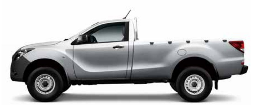
Regular Cab 4WD