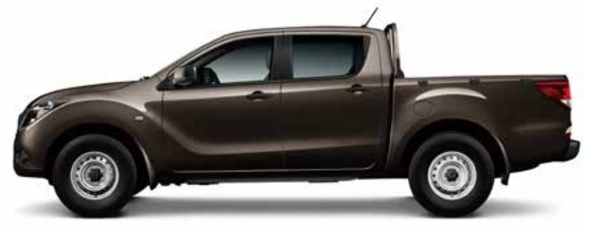
Double Cab 2WD