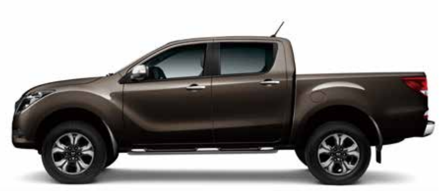
Double Cab 4WD