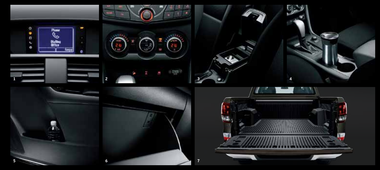
1. Multi Function Display gives positive confirmation of operations. 2. Dual-zone air conditioner features dial type controls with in-dial temperature displays. 3. Large floor console with armrest and double-decker storage compartments. 4. Dual front cupholders in the floor console. 5. Large-capacity door pockets easily accommodate 1-litre bottles. 6. AUX/USB connectors in the passenger glove box allow easy connection of portable music players. 7. Class-leading cargo box has grooves and channels for easy installation of a deck and dividers.

socket, and there's a 3.5-inch monochrome bottle holders in each front door pocket. The cargo box achieves class-leading carrying capacity, while class-top towing capability leisure equipment.