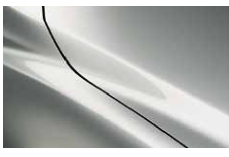
Aluminium Metallic (38P)