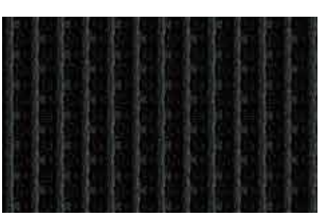
Standard cloth, Black