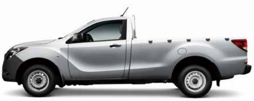
Regular Cab 2WD