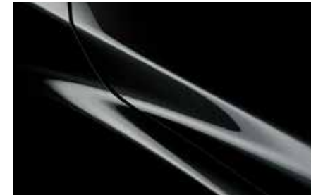
Jet Black Mica (41W)